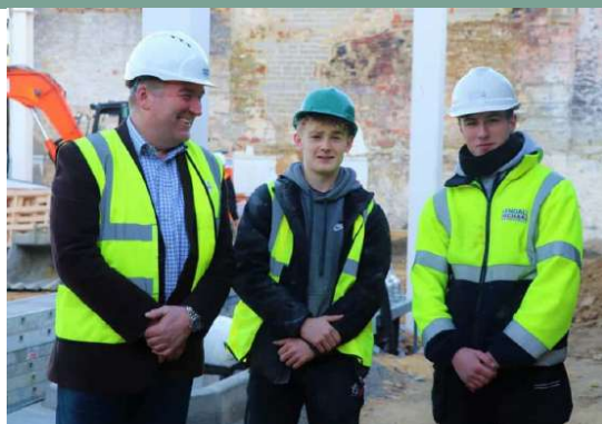
Celebrating National Apprenticeship Week - turn to pages 31-37.