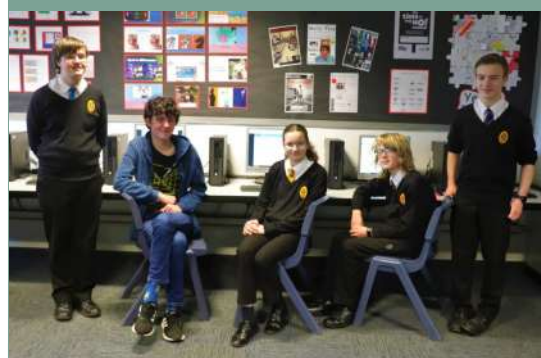
Students are among the top problem solvers in the country - find out more on page 28.